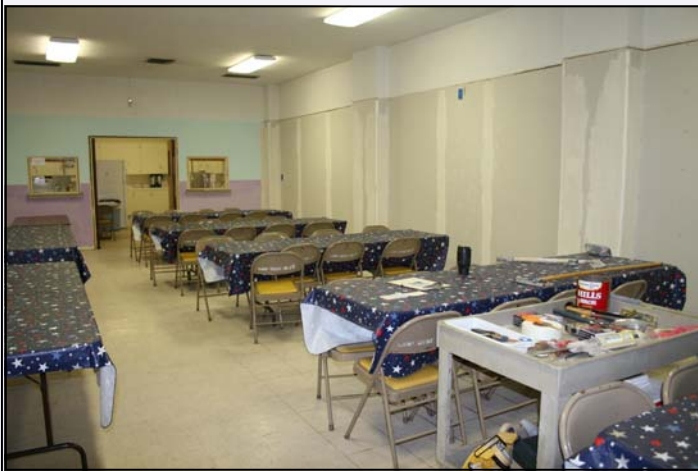
Drywall covers the old walls and paint scheme