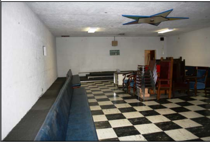
Giacobbi Lodge room prepared for sealing and taping