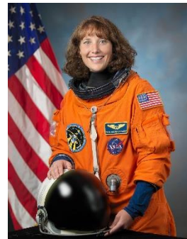
Dorothy M. Metcalf - Lindenburger Astronaut