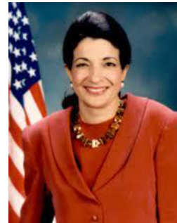
Olympia J. Snowe US Senator