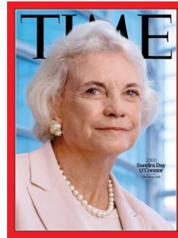
Sandra Day O'Connor Former Supreme Court Justice