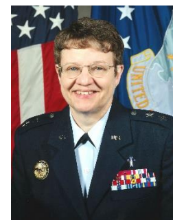
Maj. Gen. (USA, Ret.) Lorraine Potter