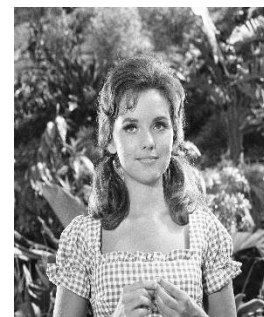
Dawn Wells Actress